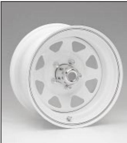
White 8 Spoke