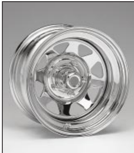
Chrome 8 Spoke